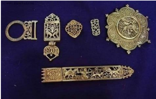
Art from the region

The Taigan has medium-length and slightly curly hair, it has a wide range of colours ranging from white and shades of fawn through to greys and black examples. [1] Since the breakup of the Soviet Union the Taigan's numbers have significantly declined, but the Russian Kennel Club has made concerted efforts to ensure the breed's survival, recognising it along with the Tazy, and trying to find good breeding stock of both breeds. [1][2]