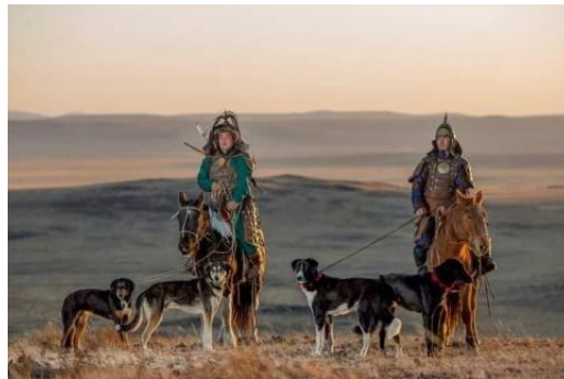
Hunting with Taigan hounds