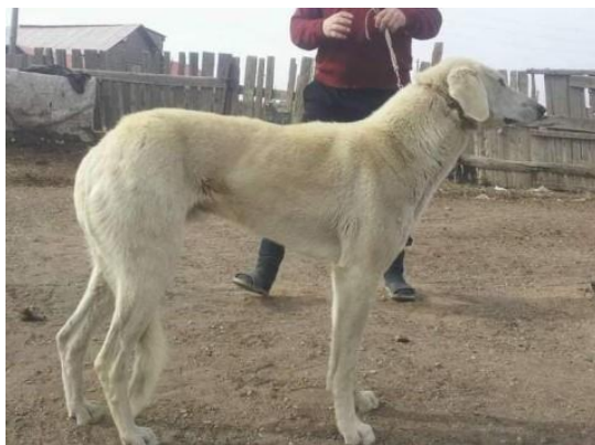
A Taigan hound