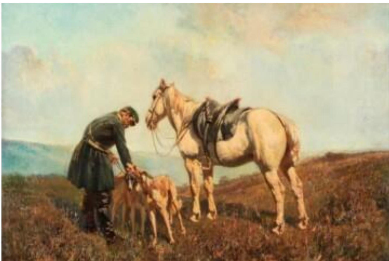
Hunter with horse and borzois (1860 – 1918)