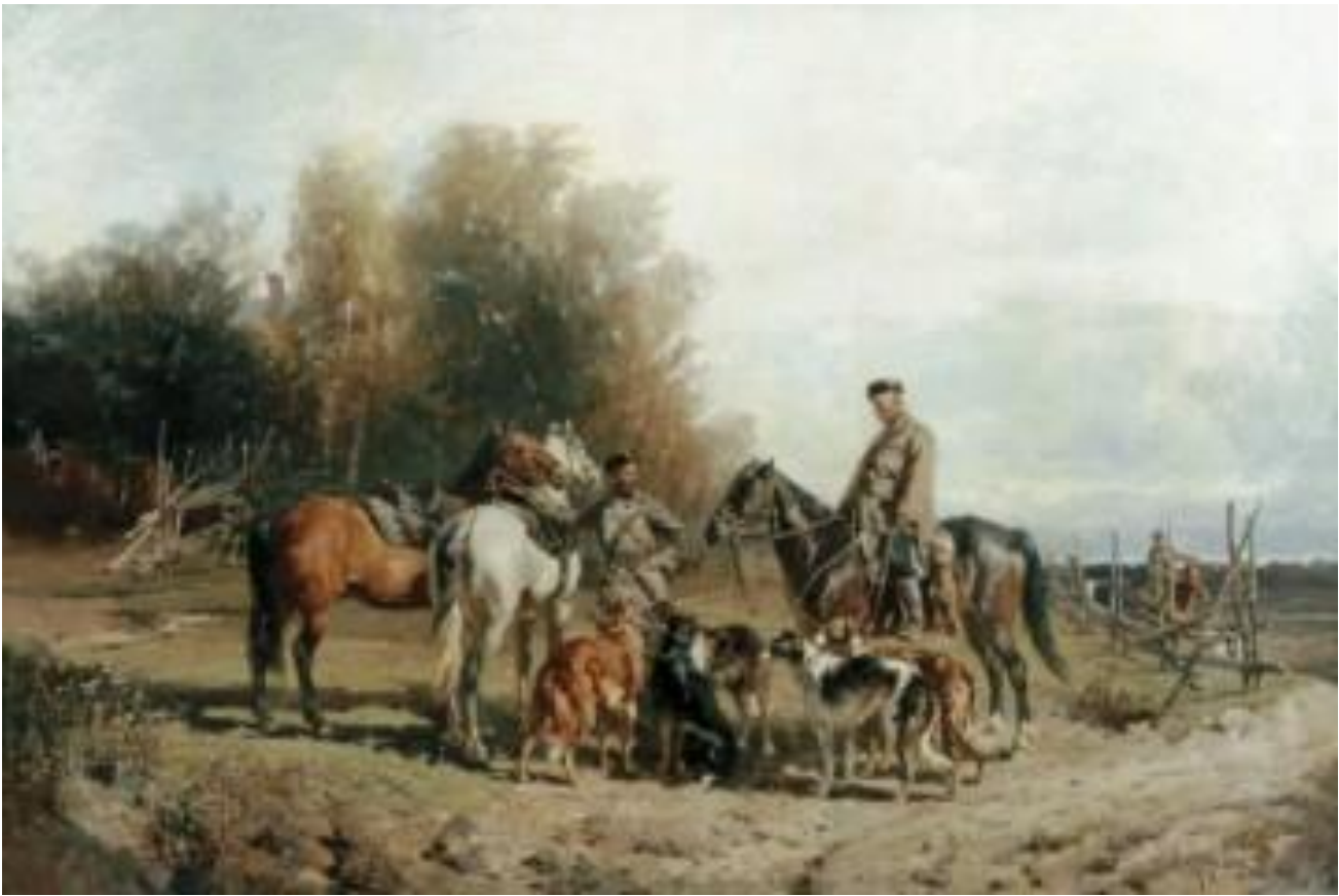
Gathering for the hunt (About 1860 – 1870)