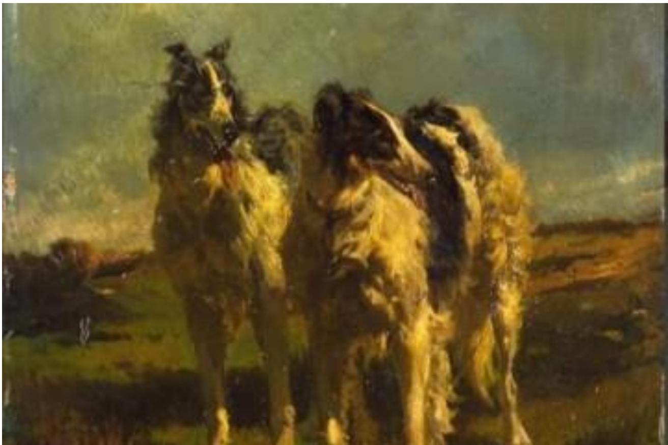
Two Borzoi (1860 -1918)