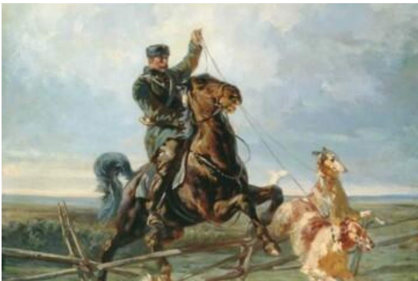
Huntsman with three borzois (1860 – 1918)